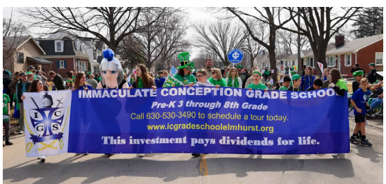
Scenes from ICGS' St. Patrick's Day activities.